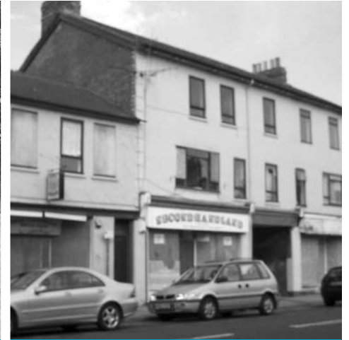
Peabody Road - Before