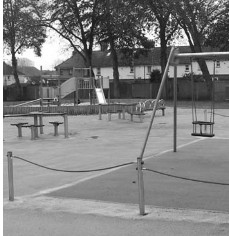
Queen's Road Recreation Ground - After