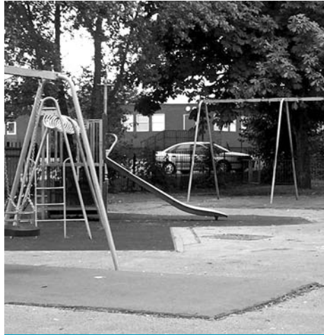
Queen's Road Recreation Ground - Before