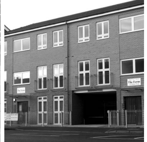
Peabody Road - After

A full list of retailers in North Camp can be found on the North Camp village website, www.northcampvillage.co.uk , where you will quickly see why the North Camp Village logo tagline 'Be Surprised' was chosen.