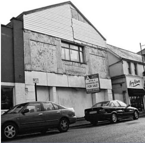
8 Camp Road - Before

Since early 2000, new businesses have invested in the area and many new shops have arrived, adding to the strong base that the more established retailers, such as the butcher, greengrocer, Post Office and Branson provide.