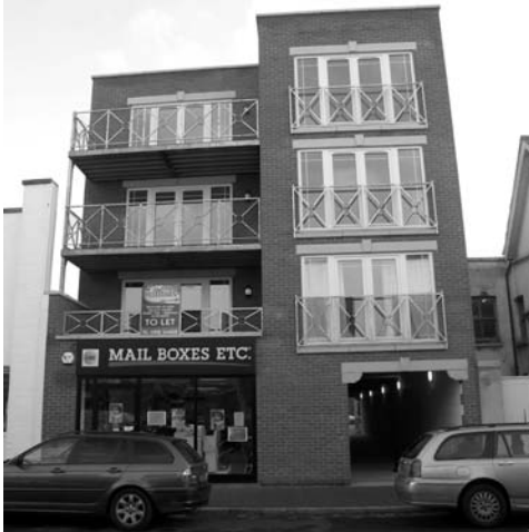
8 Camp Road - After